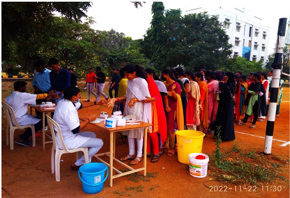
First year students of TEC participating in Blood Grouping Camp