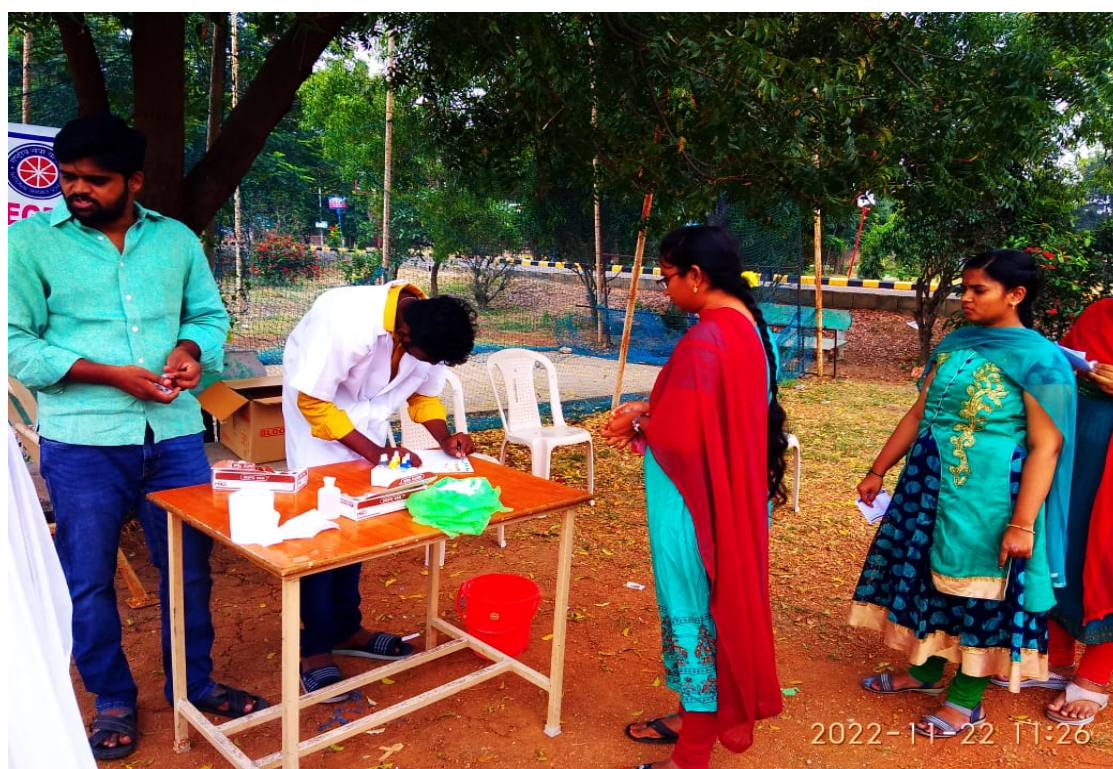
First year students of TEC participating in Blood Grouping Camp