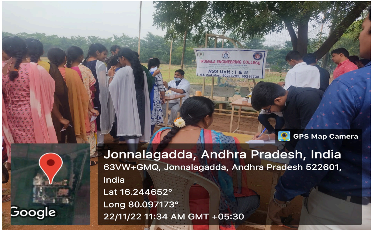
First year students of TEC participating in Blood Grouping Camp