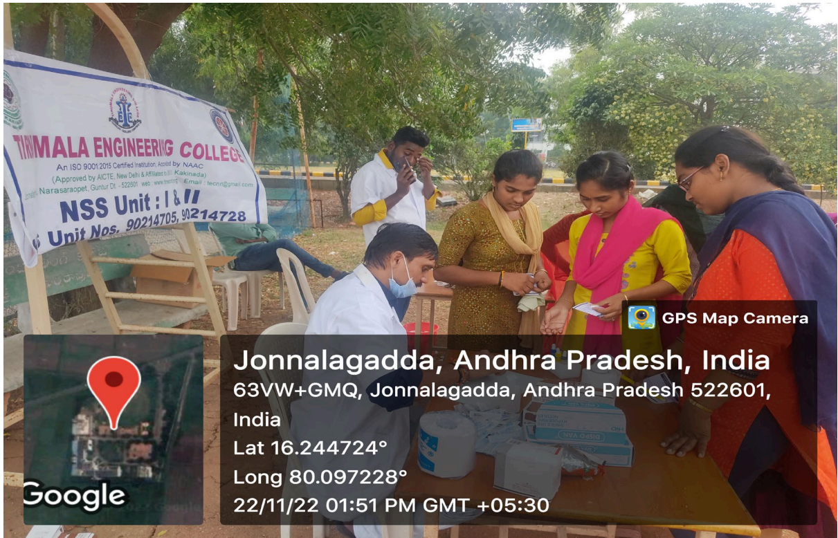
First year students of TEC participating in Blood Grouping Camp