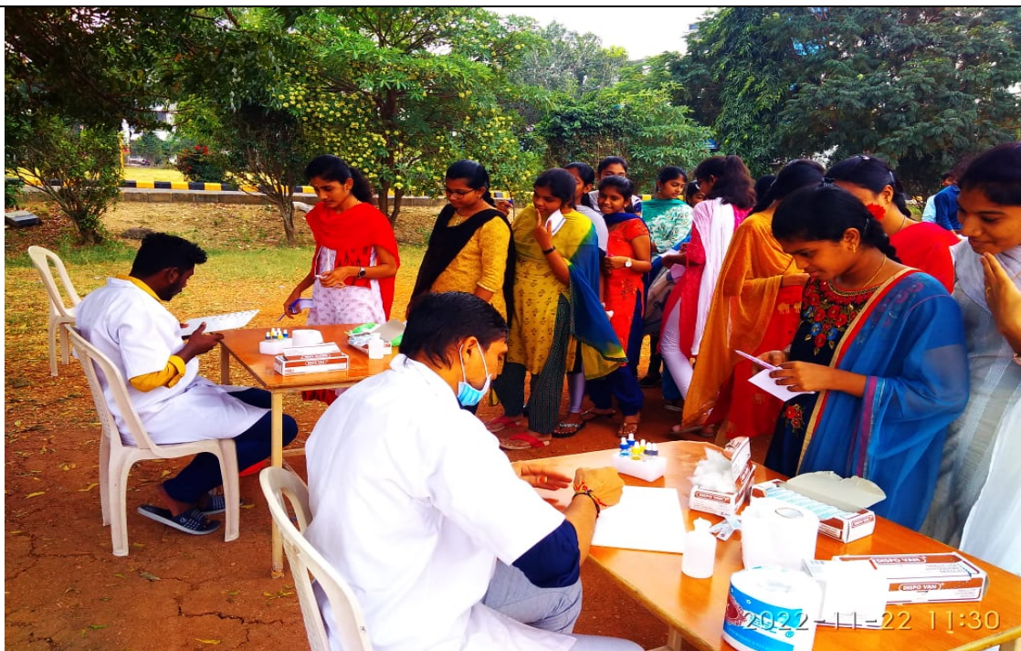
First year students of TEC participating in Blood Grouping Camp