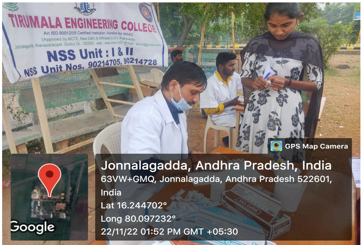
First year students of TEC participating in Blood Grouping Camp