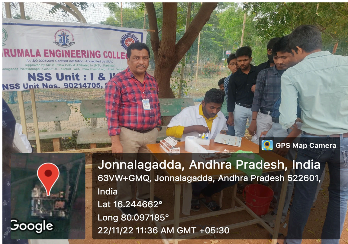
NSS PO of TEC organizing the Blood Grouping Camp